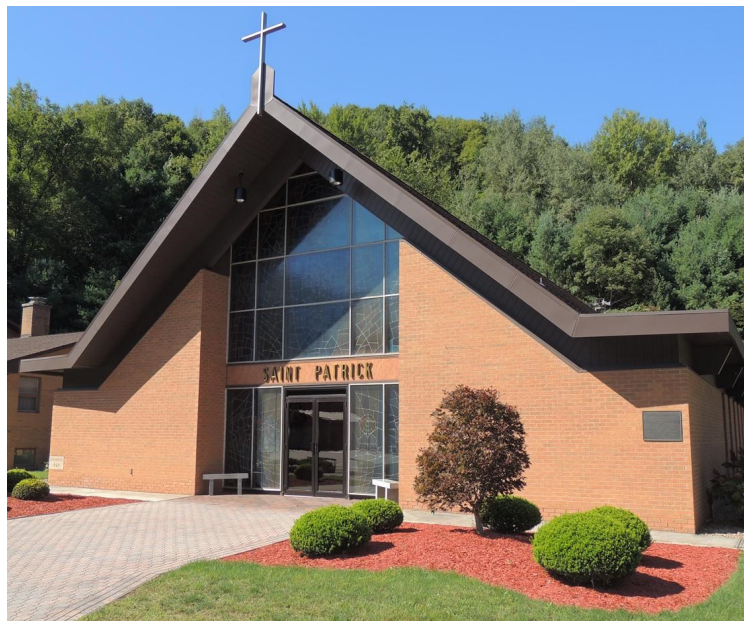
A Parish of the Diocese of Greensburg A Pennsylvania Charitable Trust

915 State Route 68 East Brady, Pennsylvania 16028 Parish Office: 724-526-5079 Fax: 724-526-3028 Parish Hall: 724-526-5180