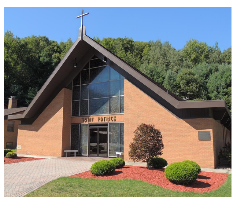
A Parish of the Diocese of Greensburg A Pennsylvania Charitable Trust