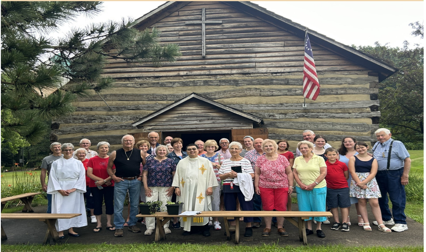
Sugarcreek Log Church July 4, 2023