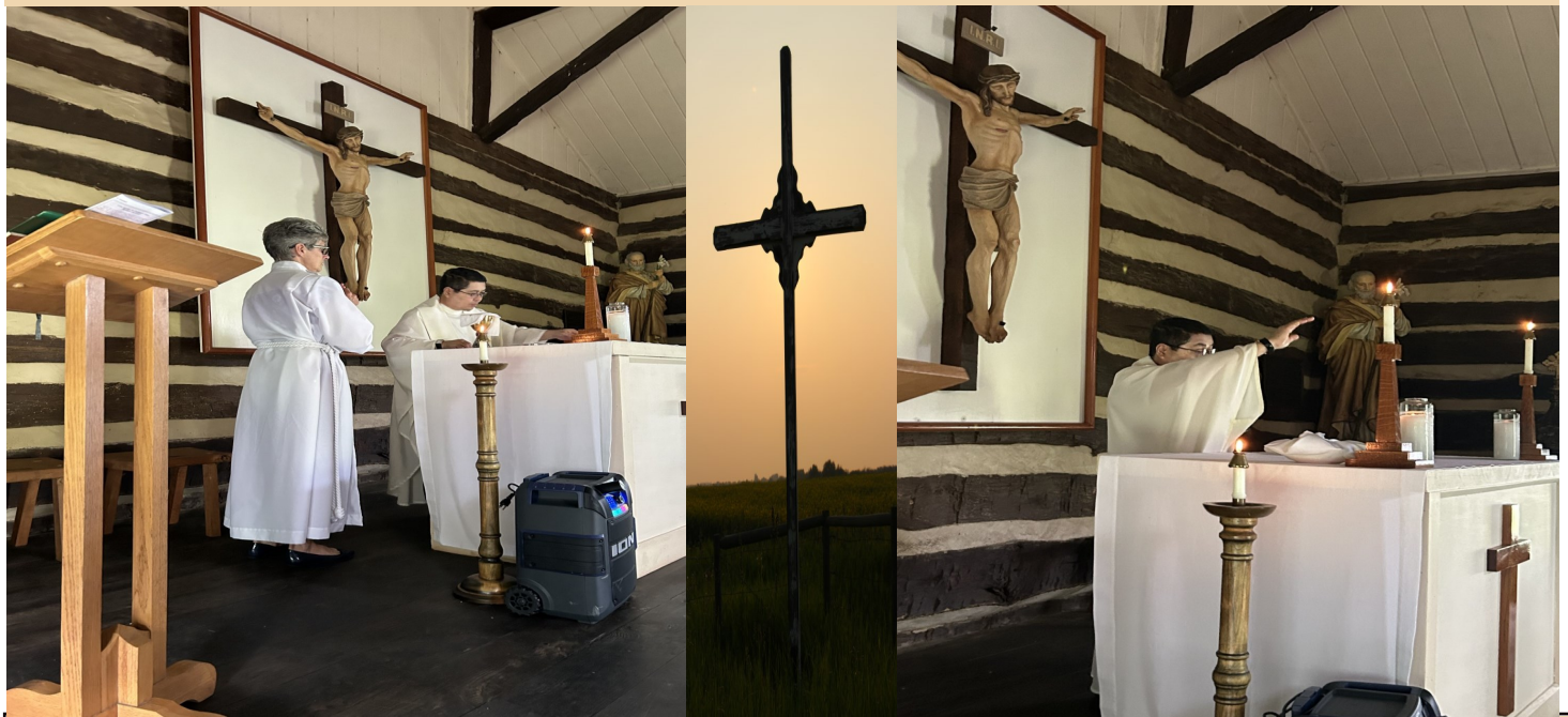
Fifteenth Sunday in Ordinary Time July 16, 2023