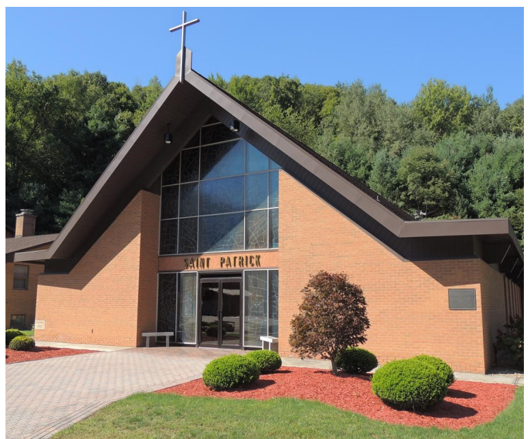
A Parish of the Diocese of Greensburg A Pennsylvania Charitable Trust