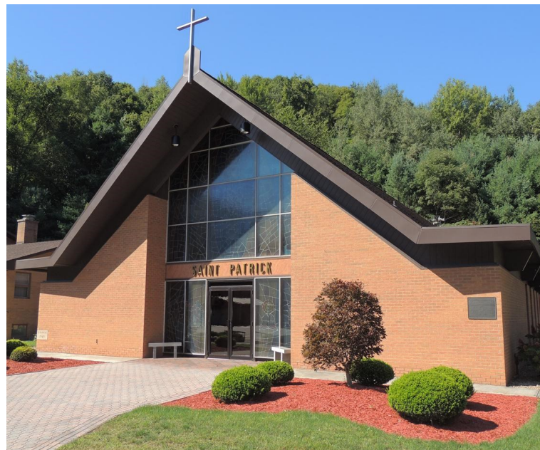
A Parish of the Diocese of Greensburg A Pennsylvania Charitable Trust

915 State Route 68 East Brady, Pennsylvania 16028 Parish Office: 724-526-5079 Fax: 724-526-3028 Parish Hall: 724-526-5180