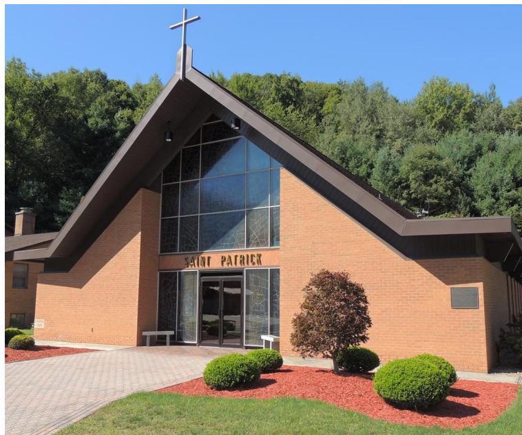
A Parish of the Diocese of Greensburg A Pennsylvania Charitable Trust

915 State Route 68 East Brady, Pennsylvania 16028 Parish Office: 724-526-5079 Fax: 724-526-3028 Parish Hall: 724-526-5180