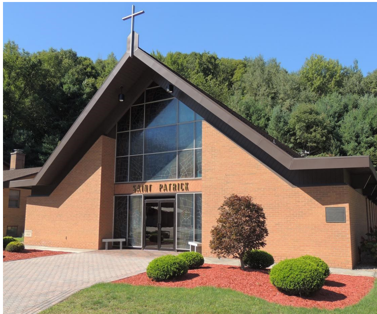
A Parish of the Diocese of Greensburg A Pennsylvania Charitable Trust

915 State Route 68 East Brady, Pennsylvania 16028 Parish Office: 724-526-5079 Fax: 724-526-3028 Parish Hall: 724-526-5180