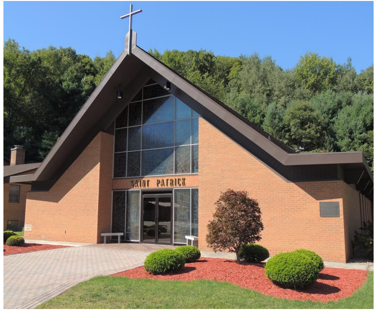
A Parish of the Diocese of Greensburg A Pennsylvania Charitable Trust

915 State Route 68 East Brady, Pennsylvania 16028 Parish Office: 724-526-5079 Fax: 724-526-3028 Parish Hall: 724-526-5180