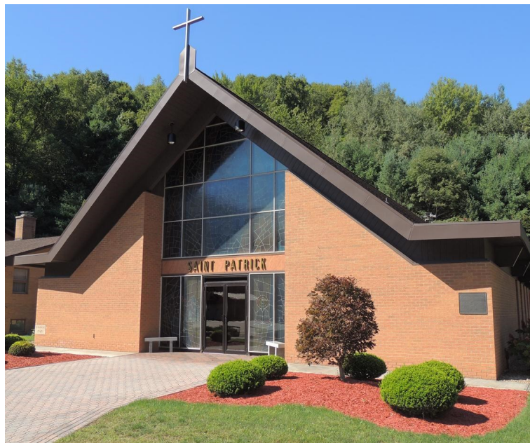
A Parish of the Diocese of Greensburg A Pennsylvania Charitable Trust

915 State Route 68 East Brady, Pennsylvania 16028 Parish Office: 724-526-5079 Fax: 724-526-3028 Parish Hall: 724-526-5180