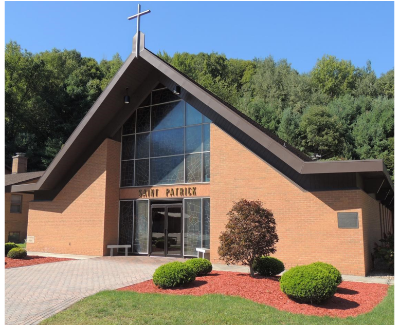
A Parish of the Diocese of Greensburg A Pennsylvania Charitable Trust

915 State Route 68 East Brady, Pennsylvania 16028 Parish Office: 724-526-5079 Fax: 724-526-3028 Parish Hall: 724-526-5180