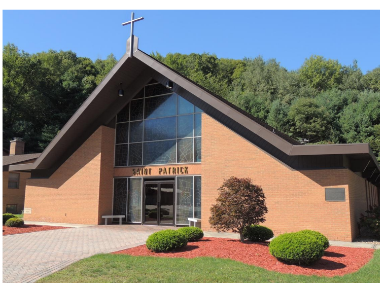
A Parish of the Diocese of Greensburg A Pennsylvania Charitable Trust