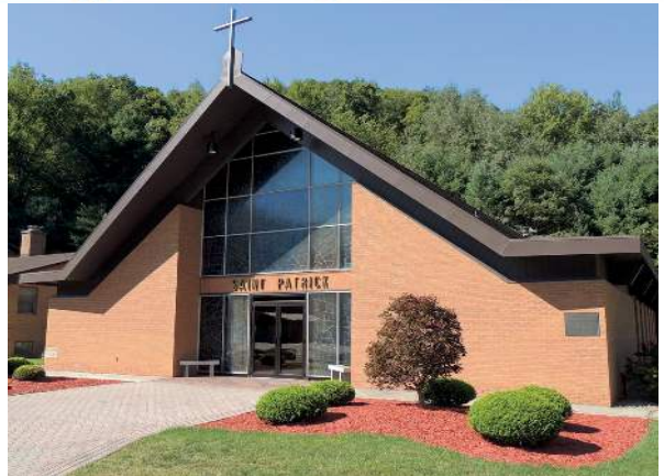
A Parish of the Diocese of Greensburg A Pennsylvania Charitable Trust

PARISH OFFICE HOURS Tuesday, Wednesday, and Thursday 9:00 am to 1:00 pm