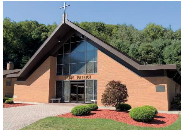
A Parish of the Diocese of Greensburg A Pennsylvania Charitable Trust